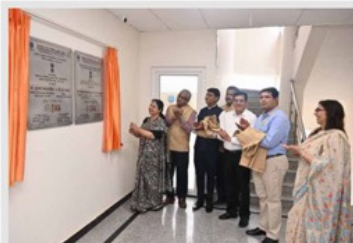
DSIR Under Science & Tech Ministry Inks Two MoUs With MSMEs In Lucknow

Lucknow, Aug 25 (KNN) The Department of Scientific and Industrial Research - Common Research and Technology Development Hub - Indian Institute of Toxicology Research (DSIR-CRTDH-IITR) facility at the Technology Development and Innovation Centre in Lucknow was inaugurated on Thursday.