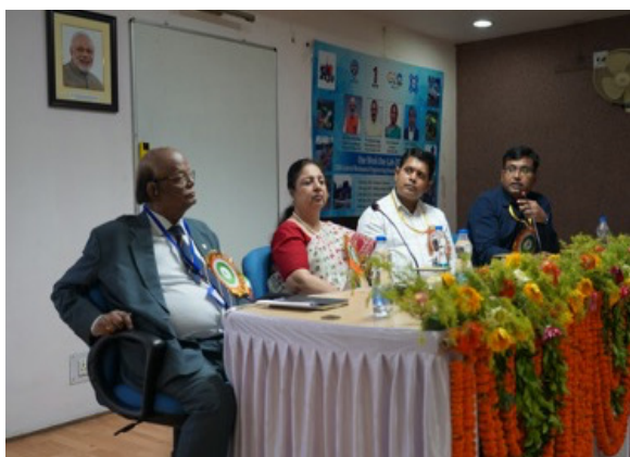
Samvad session in progress at CSIR-CMERI, Durgapur.