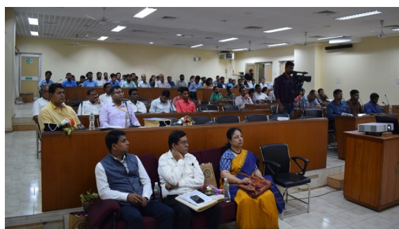
Participation of stakeholder at Chintan Shivir at IIT Kharagpur

and would lead to successes in providing affordable and accessible care for the last mile population. The collective wisdom, commitment, and passion demonstrated during the event, are indeed harbingers of a bright and promising future innovations, disruptions and collaboration. The organizers, participants, and all involved can reflect on this landmark event with pride and anticipation for the transformative impact it is poised to unleash and foster an ecosystem approach in the realm of affordable healthcare.