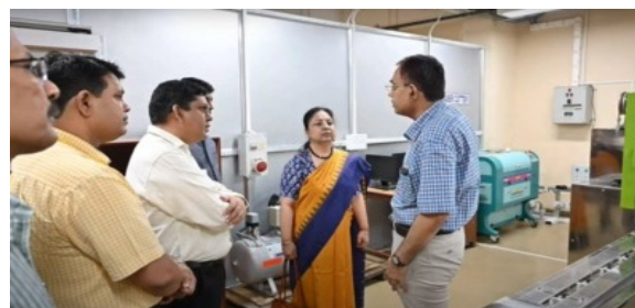
Tour of the CRTDH facility by CRTDH coordinator at IIT Kharagpur