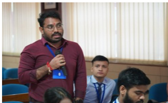
Representatives from MSMEs in dialogue at ‘Chintan Shivir’ at CSIR-CMERI, Durgapur