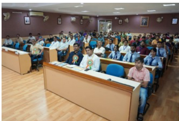
Participation of stakeholder at Chintan Shivir at CSIR-CMERI, Durgapur