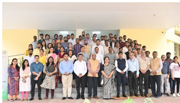
Participation of stakeholder at 'Chintan Shivir' at CSIR IITR, Lucknow.

The positive impact of this event on the region's growth and development of MSMEs is expected. Such events not only disseminate knowledge but also encourage the adoption of advanced technologies and best practices, ultimately contributing to the enhancement of the MSME sector's capabilities and its role in the region's economic development.