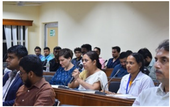
Representatives from MSMEs in dialogue at Chintan Shivir at IIT Kharagpur