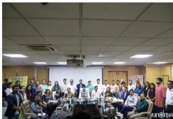
Participation of stakeholder at Chintan Shivir held at DPSRU, New Delhi

The “Samvad” sessions encouraged dialogue and collaboration, emphasizing the importance of understanding industry challenges and the contributions of research institutions. The impact of Chintan Shivir will continue to benefit the healthcare industry, fostering innovation and empowering MSMEs, positioning India competitively globally. Its resounding success promises to shape the future of healthcare MSMEs and emerging startups.