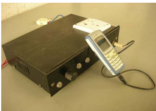
Mobile operated remote switch