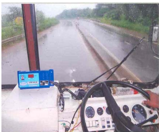
Digital Talk Friend(STF) for Speed Warning and Limiting Device