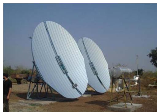
Hybrid system for solar distillation and drying application