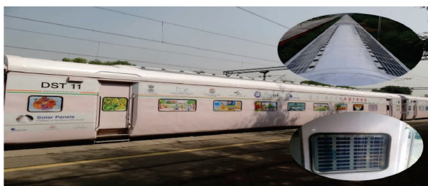
Solar Modules Developed for Science Express