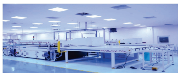
Automated module manufacturing production facility